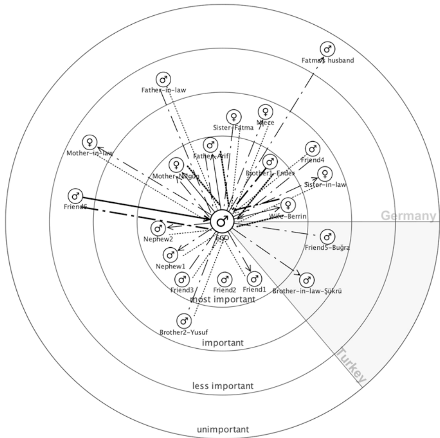
Fig. 8.2 Bora’s network map

that I need to be prepared all the time. When my children were younger, they were coming home from school hungry. I needed to feed them and with good meals, so that they can grow up and concentrate on their schools and be successful. Back then my husband was earning good money, we could spend but also save some of it. This requires also a lot of organizing all around, so that children have a regularity [...] Sometimes we hear children who could not keep up with the school here [in Germany], they go out, drink alcohol, use drugs. Who wants these things for their children? Nobody, of course! But for that not to happen you need to work at home hard. A neat family environment is needed, so I made a nice home with good food, clean and safe environment. [...] My husband has never hit my children which is very common in other families I hear. For us, our children’s well-being and success is the most important [...] This is how we brought up our children, and it even continues today, when they need any help they come to us and when we need help we go to them. I feel responsible to make sure everyone feels this familyhood and being supported because we live in another country, it is already very difficult but we all have each other’s back. [...] Sometimes if they cannot really tell to their sister or brothers what they need, if one of them has more, I make sure that they all share what they have and help the one in need.’